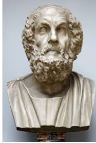
The Odyssey an epic poem by Homer

Learning Intention: Explore and understand the key elements of the epic poem, its origins and development.